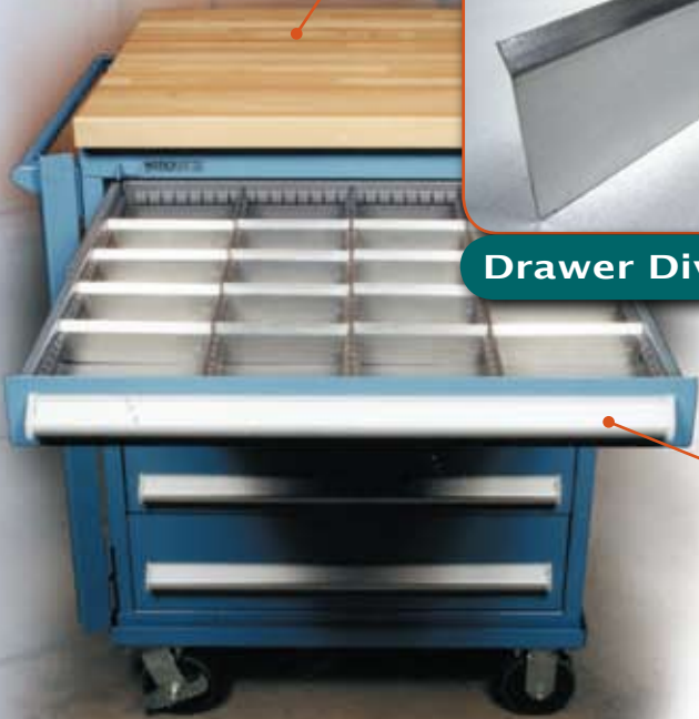
Aluminum Handle with Paper Label and Plastic Label Cover