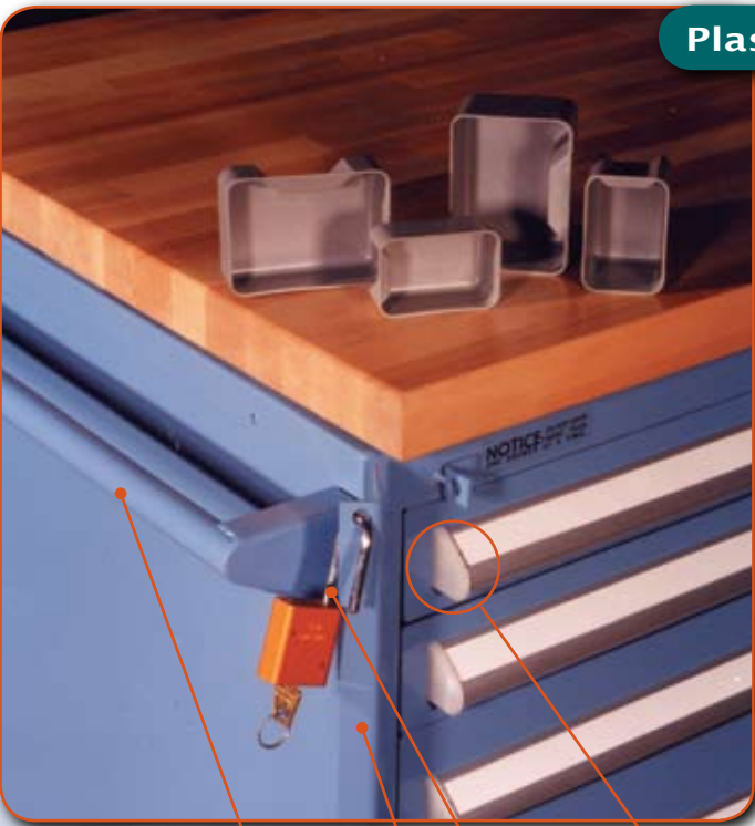
Plastic End Cap